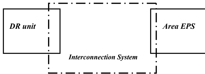
Figure 2. Schematic of Interconnection

3.1.9 interconnection: the result of the process of adding a DR unit to an Area EPS. (see Figure 2).